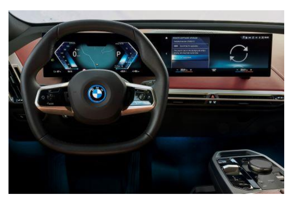
This Remote Software Upgrade updates existing functions for equipped vehicles and includes quality enhancements.