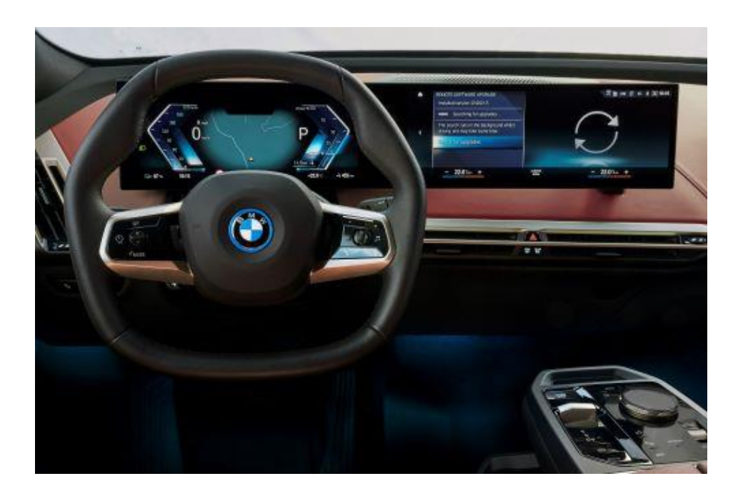
This Remote Software Upgrade updates existing functions for equipped vehicles and includes quality enhancements.